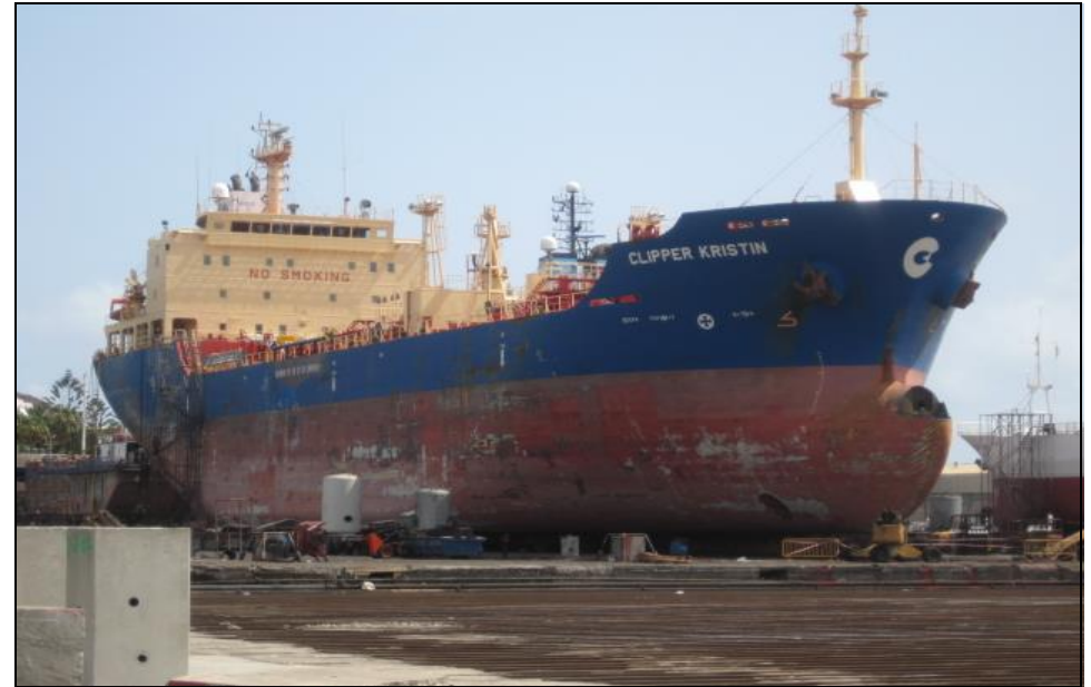
m/t Clipper Kristin – Chemical tanker – Astican Las Palmas August 2007 Dry docking and steel repair.