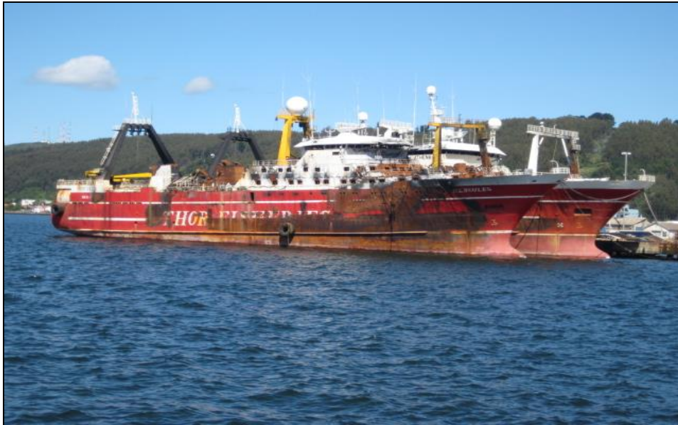
M/tr Hercules – Fishing stern trawler – November 2007 Talcahuano Chile. Engine room inspection after fire