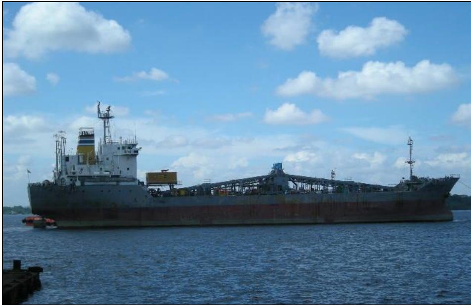
m/v Valbella – Cement vessels – Colombo July 2007 Repairs and dry docking specification.