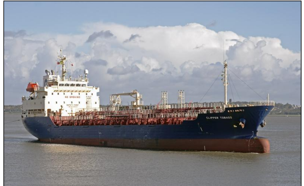
m/t Clipper Tobago – Chemical tanker – Houston November 2007 Supervision of SS tank repair.