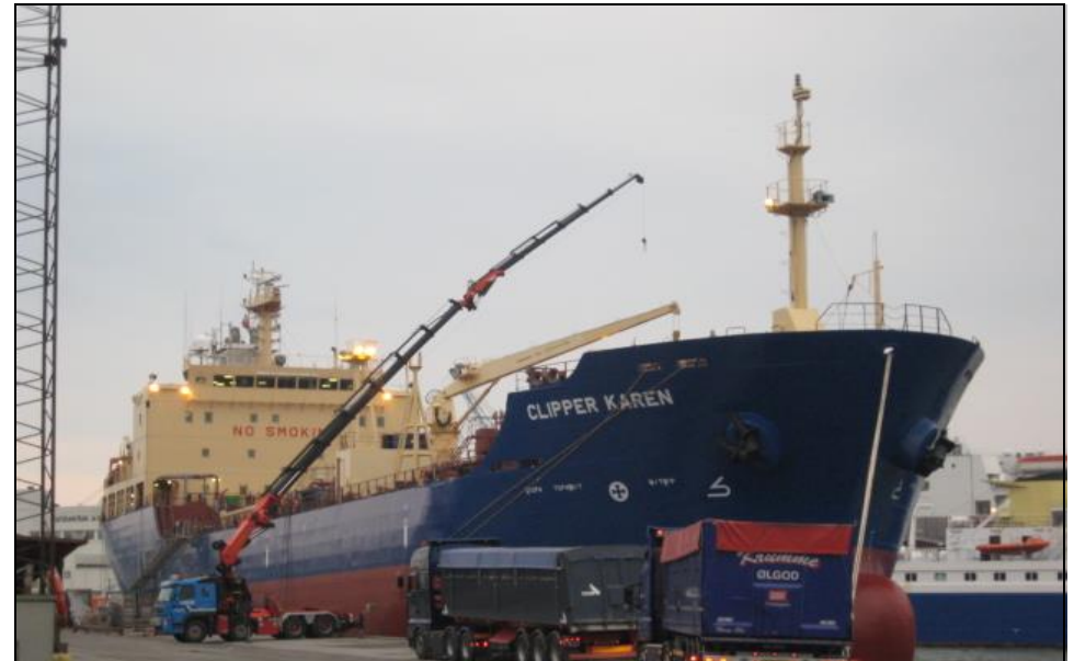
4. Clipper Karen – Chemical tanker - Nov 2007 Frederica Shipyard Dry docking, installation of inert gas system and stern manifold.