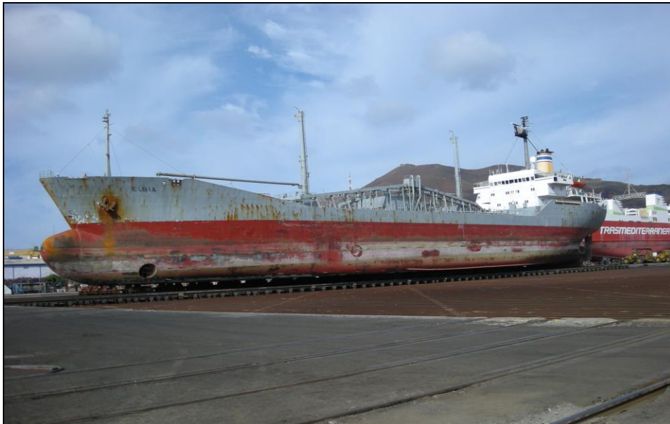
m/v Elbia – Cement vessel – Maceió Brazil October 2007 Repairs and DD specification